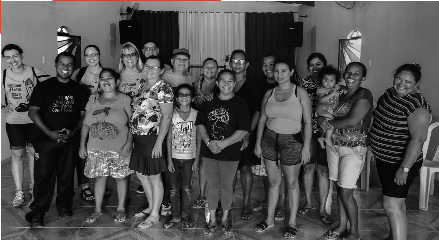
“OUR INVESTMENT IN GLOBAL PARTNERS LIKE THE FIRST MISSIONARY BAPTIST CHURCH IN CEARA, BRAZIL”