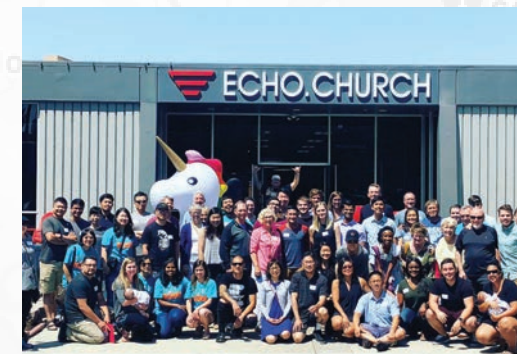
Echo Groups Leaders, SVL Campus