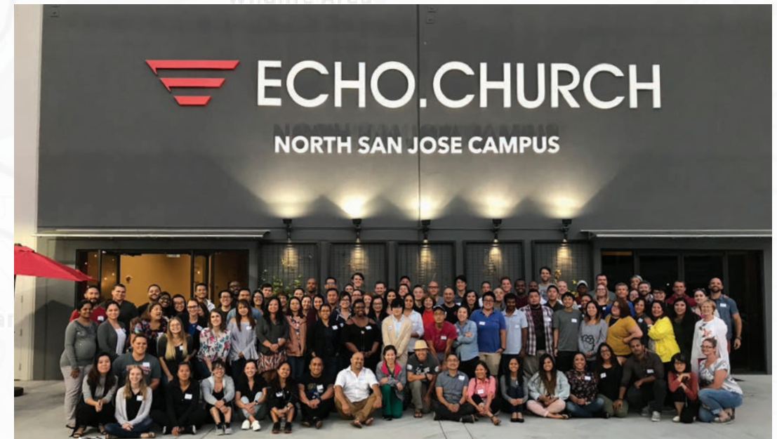
Echo Groups Leaders, NSJ Campus