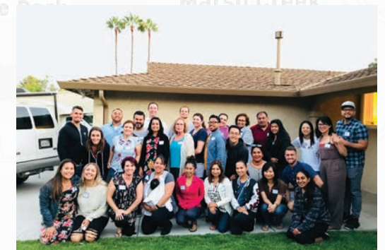
Echo Groups Leaders, SSJ Campus